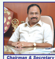
Chairman & Secretary